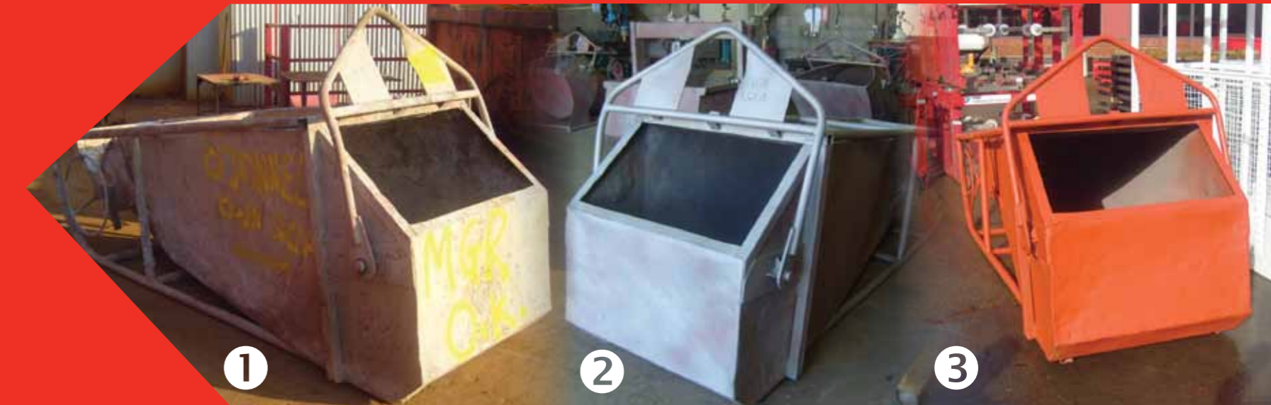
1 Customers own equipment returned for repair, cleaning and testing